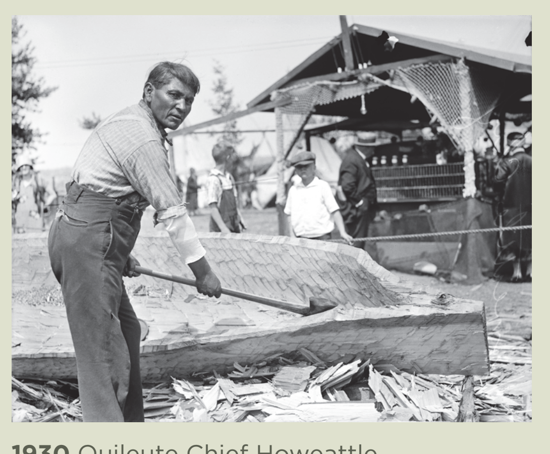
1930 Quileute Chief Howeattle demonstrating building canoe