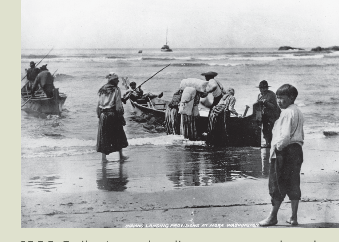
1900 Quileutes unloading canoes on beach