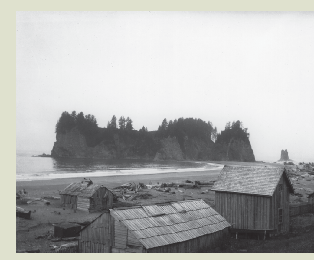
1905 Quileute buildings with view of James Island Special Collections, NA1255