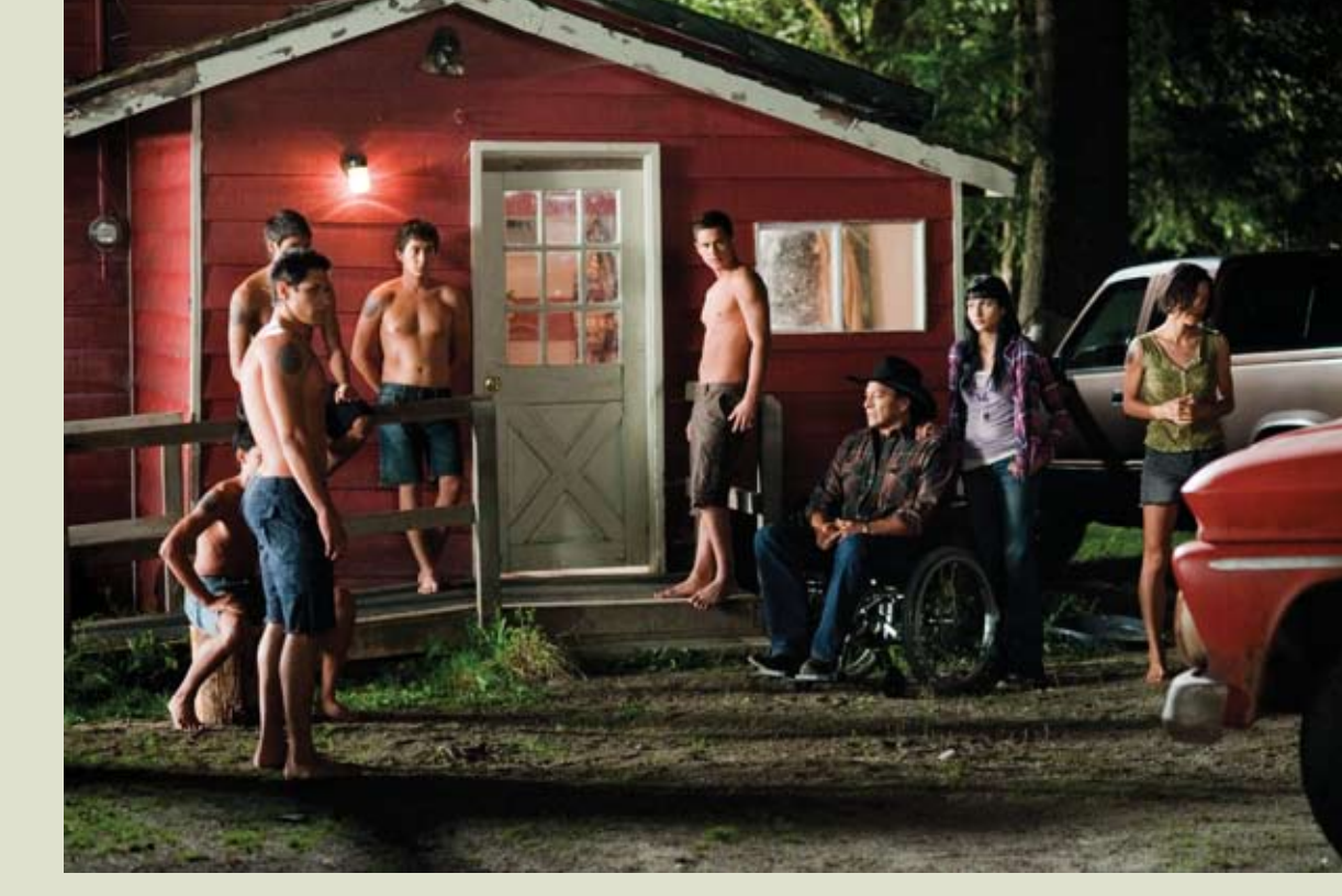
2010 Wolf Pack, Twilight Saga: Eclipse Courtesy Summit Entertainment

1905 Quileute totem pole, La Push Edmond S. Meany, 1905, University of Washington Libraries, Special Collections, NA1256