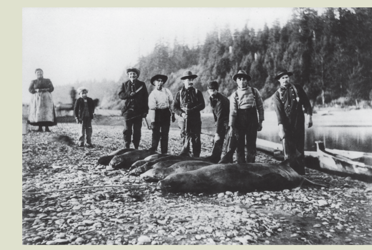
1896 Quileute men with seals after hunt