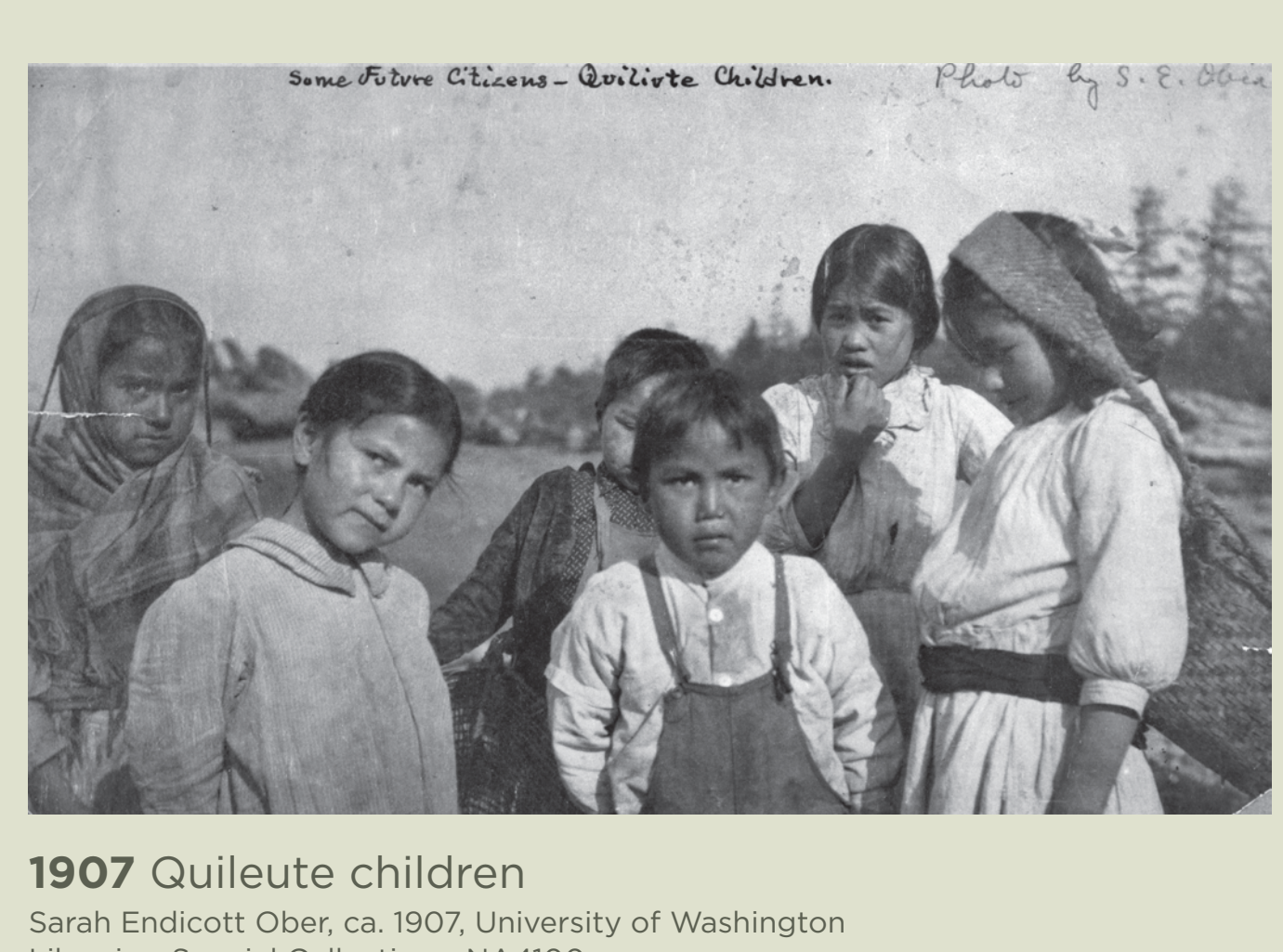
Libraries, Special Collections, NA4100