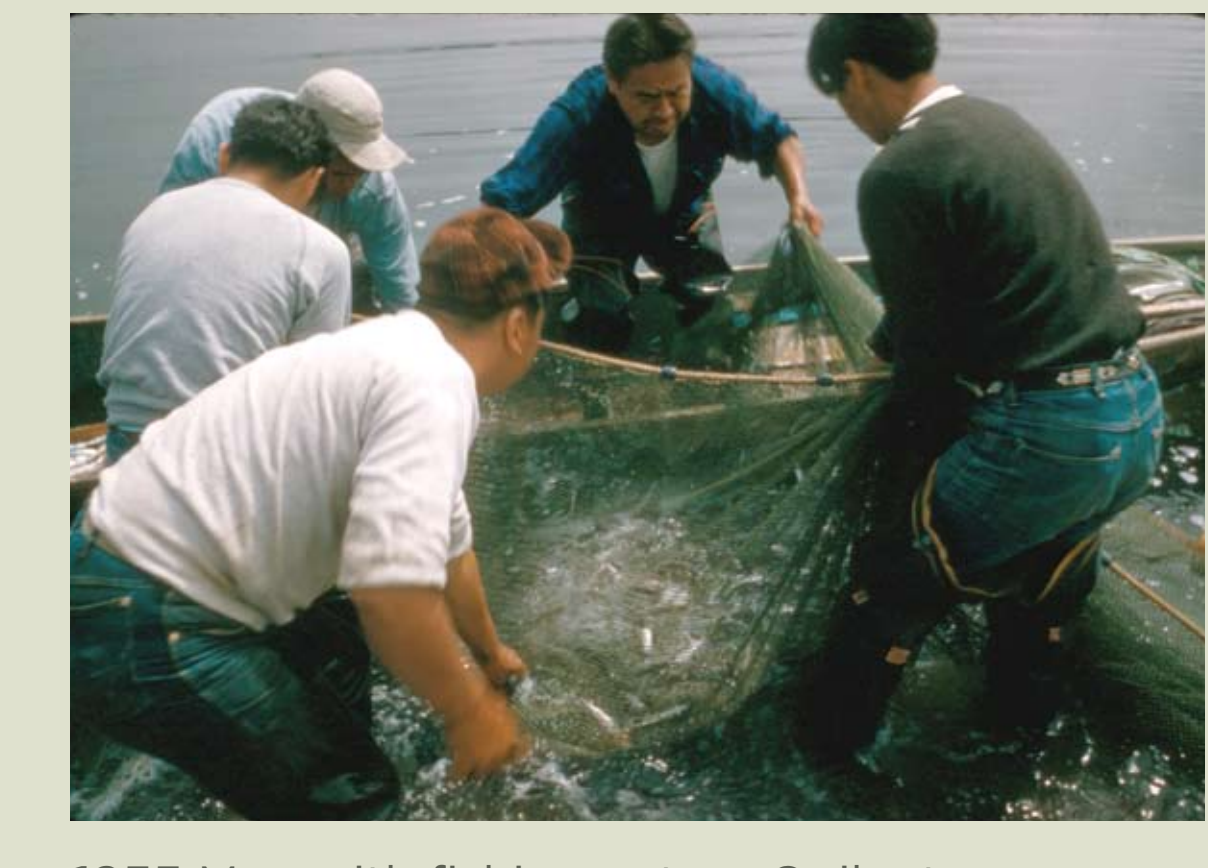
1955 Men with fishing net on Quileute Indian Reservation